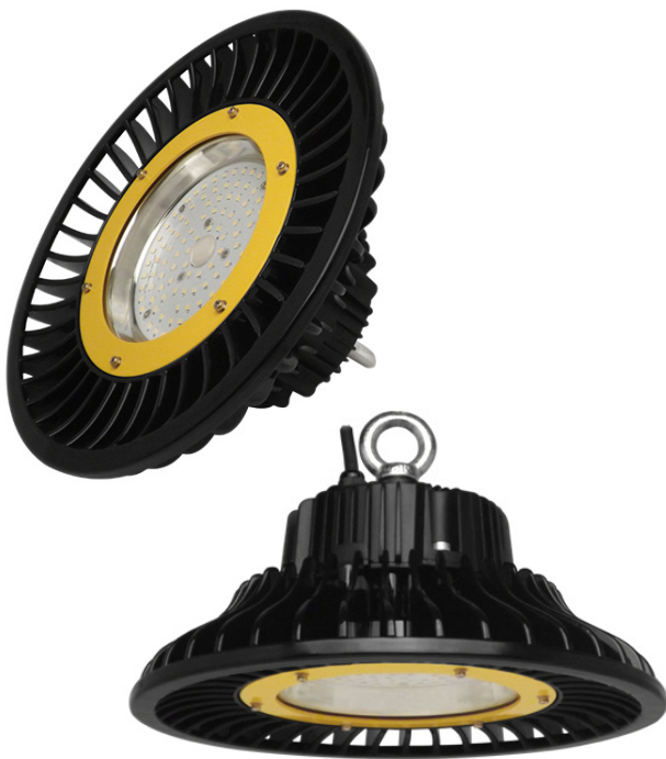
LED High Bay - EFX-ASLUFO150W