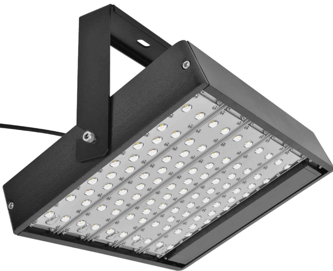
LED High Bay - EFX-AGHB180W