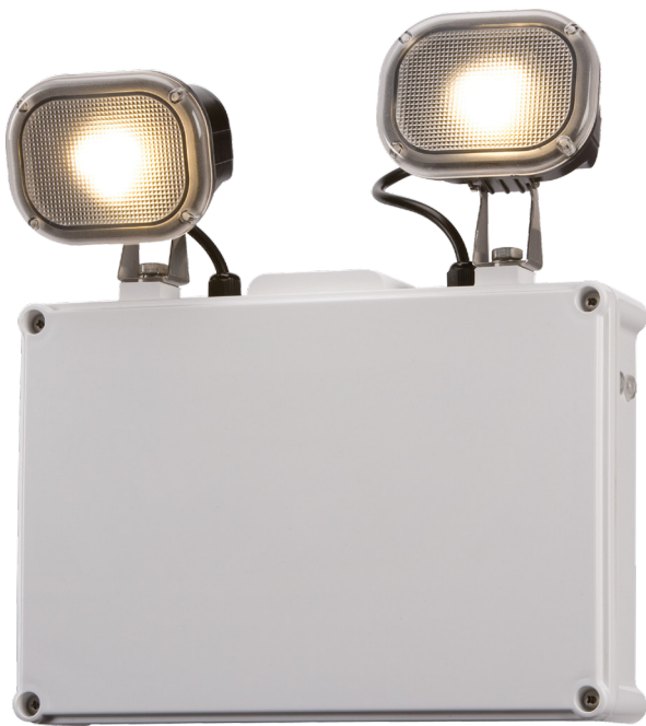
LED Twinspot - EFX-TLTS2x3W