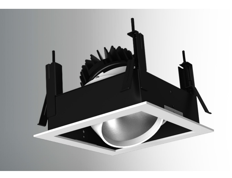
LED Downlight - EFX-RSDLA5W