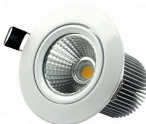
LED Downlight - EFX-GLDL10W