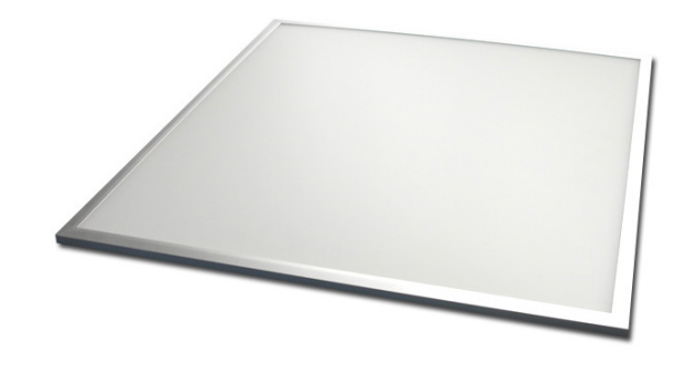
LED Panel Light - EFX-VTLP45W