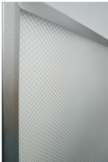
LED Panel Light - EFX-SHLP45W(L)